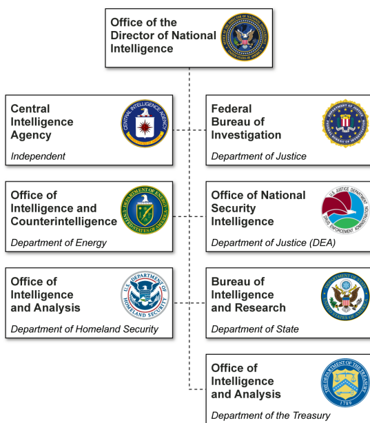
Figure 1: Civilian IC Elements and Their Respective Departments